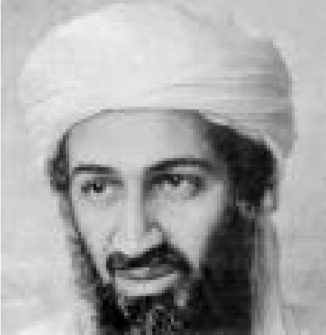
Osama Bin Laden International Terrorist